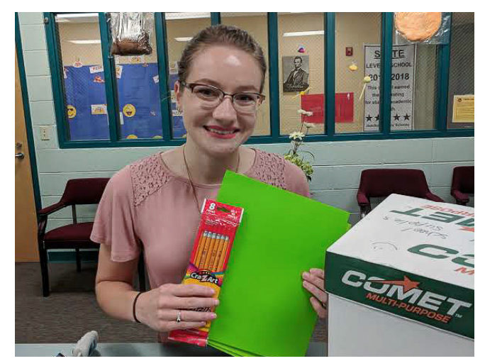
Staff of Soddy Elementary were happy to receive a box of donated school supplies!

In August, SCCU members and staff collected school supplies for local students in need. The hundreds of items were then distributed to Dupont Elementary in Hixson, Woodmore Elementary in Brainerd, and Soddy Elementary in Soddy Daisy.